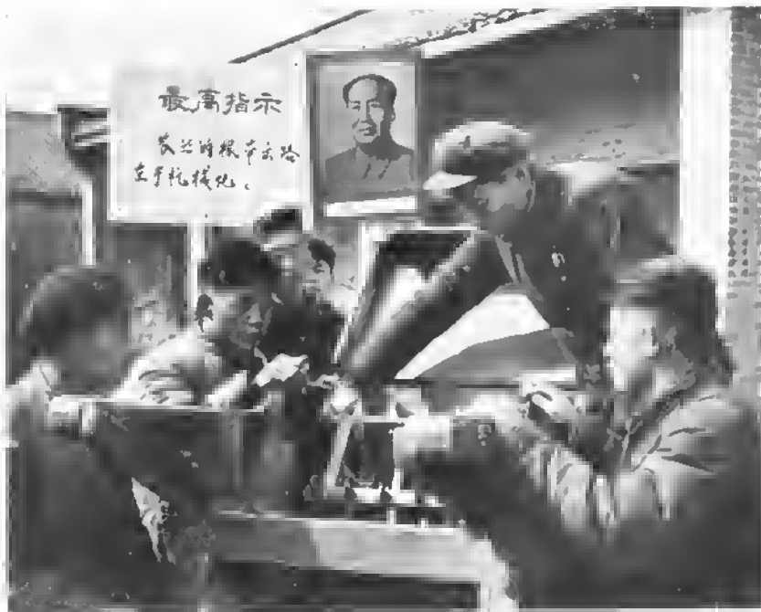
Passing on repair and technical know-how to the peasants — farm machinery workers of Hsuehchou county, Hupeh province.

novations and help the communes and brigades set up wide repair networks.